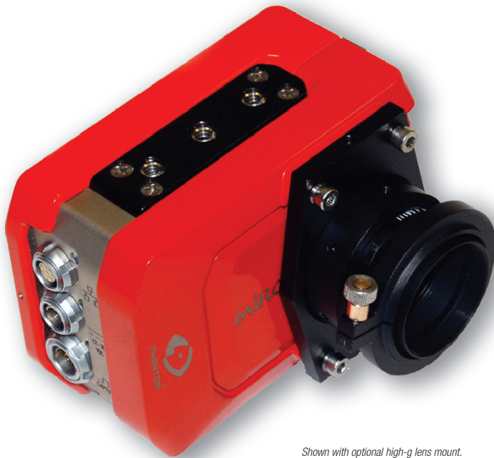
Shown with optional high-g lens mount.

Your Ideal Solution for Airborne Applications