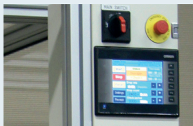
5.7" color display