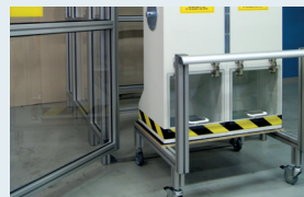
Easy to change barrels