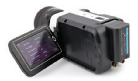
Phantom Miro LC321S with Canon EOS Mount

There are even several common setups pre-installed on the LC-Series. Just select the one you want with a tap on the screen.