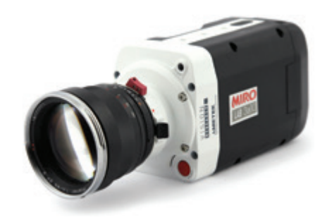
Phantom Miro LAB3a10

Our Miro camera line is supported by Vision Research's Global Service and Support network offering AMECare Performance Services from multiple sites around the globe. Maximize the value of your Phantom camera by learning more about our service and support options at https://www.phantomhighspeed.com/Service-Support/Technical-Support.