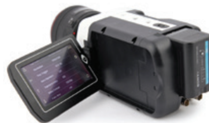
Phantom Miro LC321S with Canon EOS Mount

There are even several common setups pre-installed on the LC-Series. Just select the one you want with a tap on the screen.