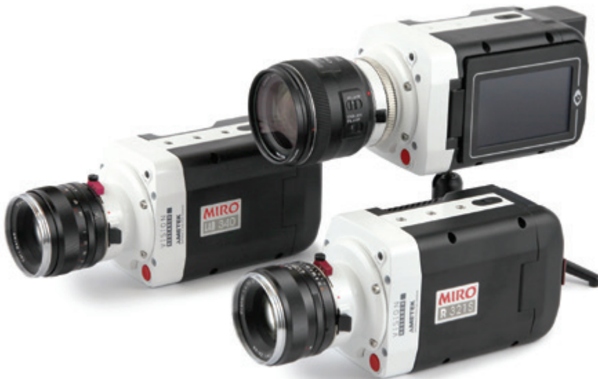
Phantom Miro LAB-, LC- and R-Series Cameras

For the most current version visit www.phantomhighspeed.com Subject to change Rev June 2016