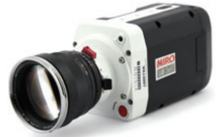
Phantom Miro LAB3a10

Our Miro camera line is supported by Vision Research's Global Service and Support network offering AMECare Performance Services from multiple sites around the globe. Maximize the value of your Phantom camera by learning more about our service and support options at https://www.phantomhighspeed.com/Service-Support/Technical-Support .