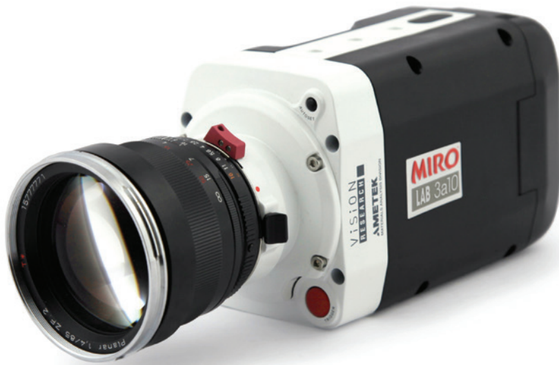
Phantom Miro LAB 3a10

Setup, capture, view, save, analyze. Powerful, high-speed imaging in a package designed for laboratory use.