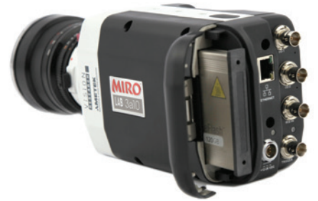
Phantom Miro LAB 3a10 showing optional CineFlash

And, PCC supports a suite of measurement tools that allows you to track points, estimate distance, velocity, acceleration and angles based on points in the cine file. These tools are in both the PCC and the Cine Viewer software packages.