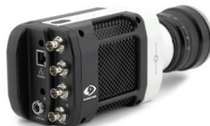
Phantom Miro LAB 3a10 - rear view