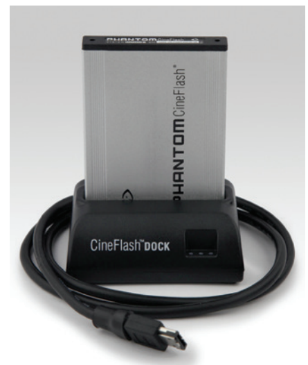
Phantom CineFlash Drive & CineFlash Dock